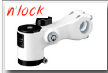
n'lock in colours: white