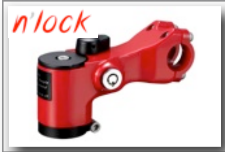
n'lock in colours: red