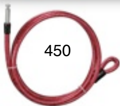
Cable 10mm by 1.5m